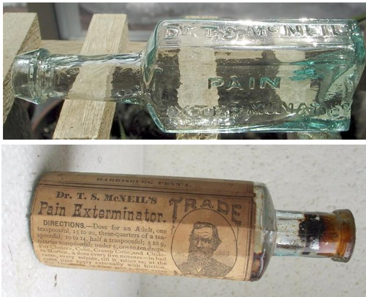
original bottles for McNeil's Pain Exterminator

The Clark family operated a chain 24 of three drug stores that sold several of their own medicines, as well as the remedies of other transient manufacturers, but the McNeil line of products appears to have been their bread and butter. No successor stores of the Clark family survive.