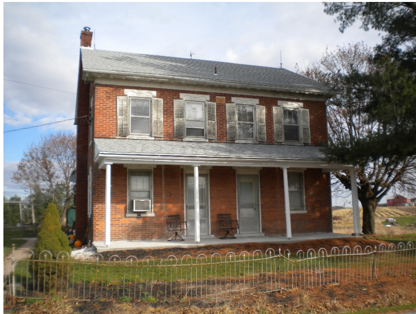
Craul Family Homestead – Creek Road, Kralltown 6