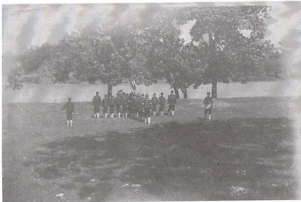
In star formation at Camp Al K. Thomas. Aqueduct. July 1900.