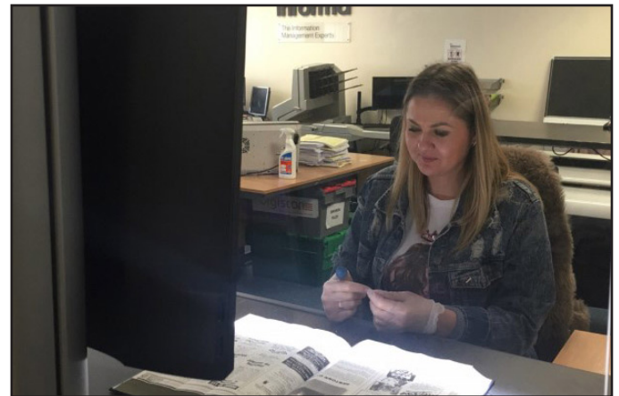
Scanning pages of the Advocate at INFORMA, Dublin.

The Methodist Historical Society of Ireland has recently completed a project to preserve and make freely available online over 150 years of Irish Methodist periodicals from 1859 to 2015. The originals are held at the MHSI archives in Belfast, Northern Ireland. The scanning and hosting of the pages was undertaken by a specialist Dublin company, Informa, and the images are accessible via the MHSI webpages.